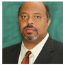
Candidate for Vice President-Elect

Final candidates for the positions of Vice President-Elect and Secretary are: