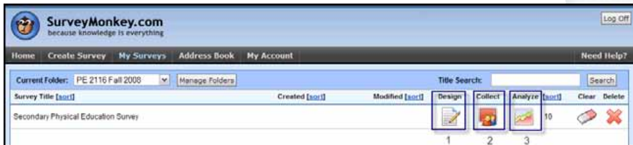
Figure 2 - Creating and Deploying a Survey

The Survey Monkey index page is very similar to other online survey websites. There is a place for visitors to sign into their account or to create a new account. On the index page are descriptions of the survey features of the website including tutorials, testimonials, pricing structures and information about the company behind the website. Perhaps the most important features of the index page are descriptions of the three steps in designing a survey. These descriptions demonstrate the intuitive process for creating and deploying a survey in only three steps (see Figure 2).